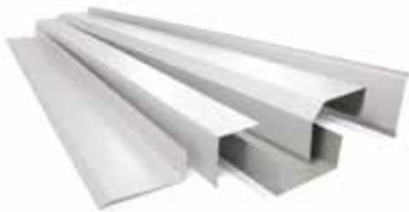
TRIMS AND FLASHING