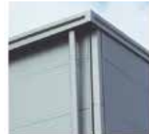
DOWN TAKE PIPES