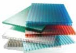
SKYLIGHT (POLYCARBONATE SHEETS)